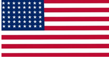
The Muur-Moor 48-Star of peace, full faith and sovereign gold-credit Great Flag: