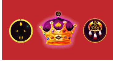
Imperial Royal Office for His-Emperial-Majesty for the Emperial CMYE-IRK Republic Great Flag: