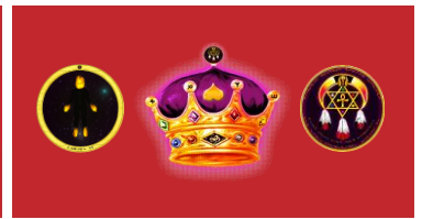
Imperial Royal Office for His-Emperial-Majesty for the Emperial CMYE-IRK Republic Great Flag: