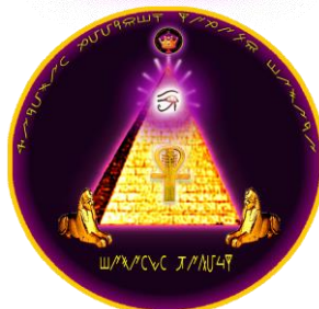
Imperial CMYE Treasury Great Seal for the Emperial CMYE-IRK Republic: