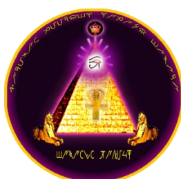
Imperial CMYE Treasury Great Seal for the Emperial CMYE-IRK Republic: