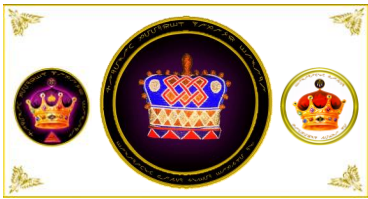
Emperial CMYE-IRK Republic for the Country of United -states national/Great Flag: