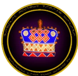
Emperial CMYE-IRK Republic for the Country of United-states Great Seal:

This Customized Imperial CMYE Treasury-Executive Mission for the IROHEM & ECMYE-IRKR, is Active and in 'Force via H.E.M.: Śambhū Ameni-Re's Royal autograph/ signature; Emperial Reference Number/IMYRS File Number: 2024-000000001 and other information can be obtained by contacting the IROHEM @ (888) 877-6481 Ext. 8; or the MFAIC @ (888) 877-6481 Ext. 6; or for mailing, Emperial CMYE-IRK Republic, c/o IROHEM, Attn: H.E.M.: Śambhū Ameni-Re 2107 N Decatur Rd Suite 513, Decatur, Georgia 30033-5303, USA; or you can visit us at: www.cmyeimperialgov.us or e-mail at imyrs@cmyeimperialgov.us