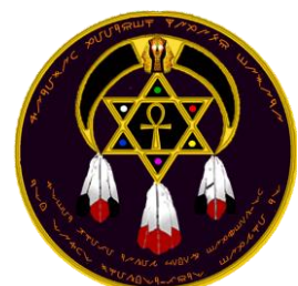
Emperial & Imperial Royal Seal for Emperor: ✨H.E.M.: Śambhū Ameni-Re 'Ade Loye':