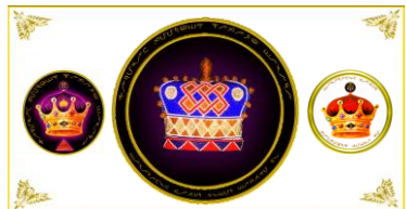
Emperial CMYE-IRK Republic for the Country of United -states national Flag: