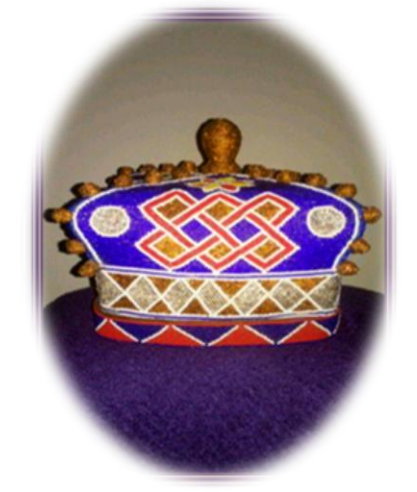
Imperial Royal Crown for Emperor-Monarch-INRI: Khufu-Ranub-Zodoq: Sampson-El for the Imperial Royal House of Sampson El-Sambhu Re 'れ本語ロー 段かんグ: