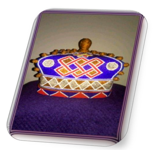
Imperial Royal Crown of the Divine 'True' Sovereign CROWN Prince: Red-Eagle: Thunder-Fire for the Emperial Royal House of Tunica-Thunder Fire ①A囲ロー ほんのご

PAGE 103 OF 216 - IMPERIAL CMYE DECLARATION - IMPERIAL CMYE GOVERNMENT DECREE, REGISTRATION NUMBER: ICMYEDGD-02212019/0831196355: